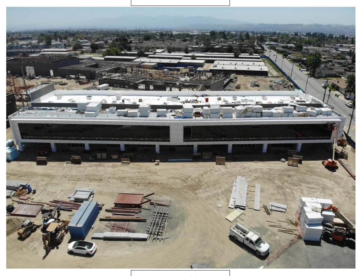
Chino HS Bldg. H